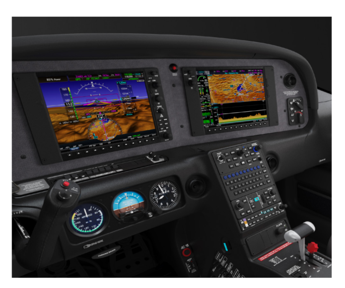
<sup>1</sup>Subscription Required. <sup>2</sup>Upgrade for SR20 Premium. <sup>4</sup>Price does not include aircraft rental.